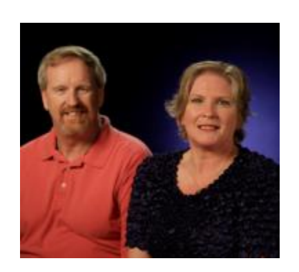
Dependents and Survivors