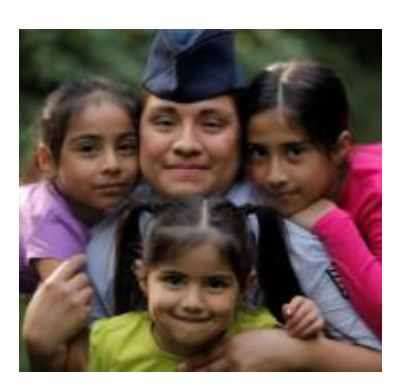
National Guard Member