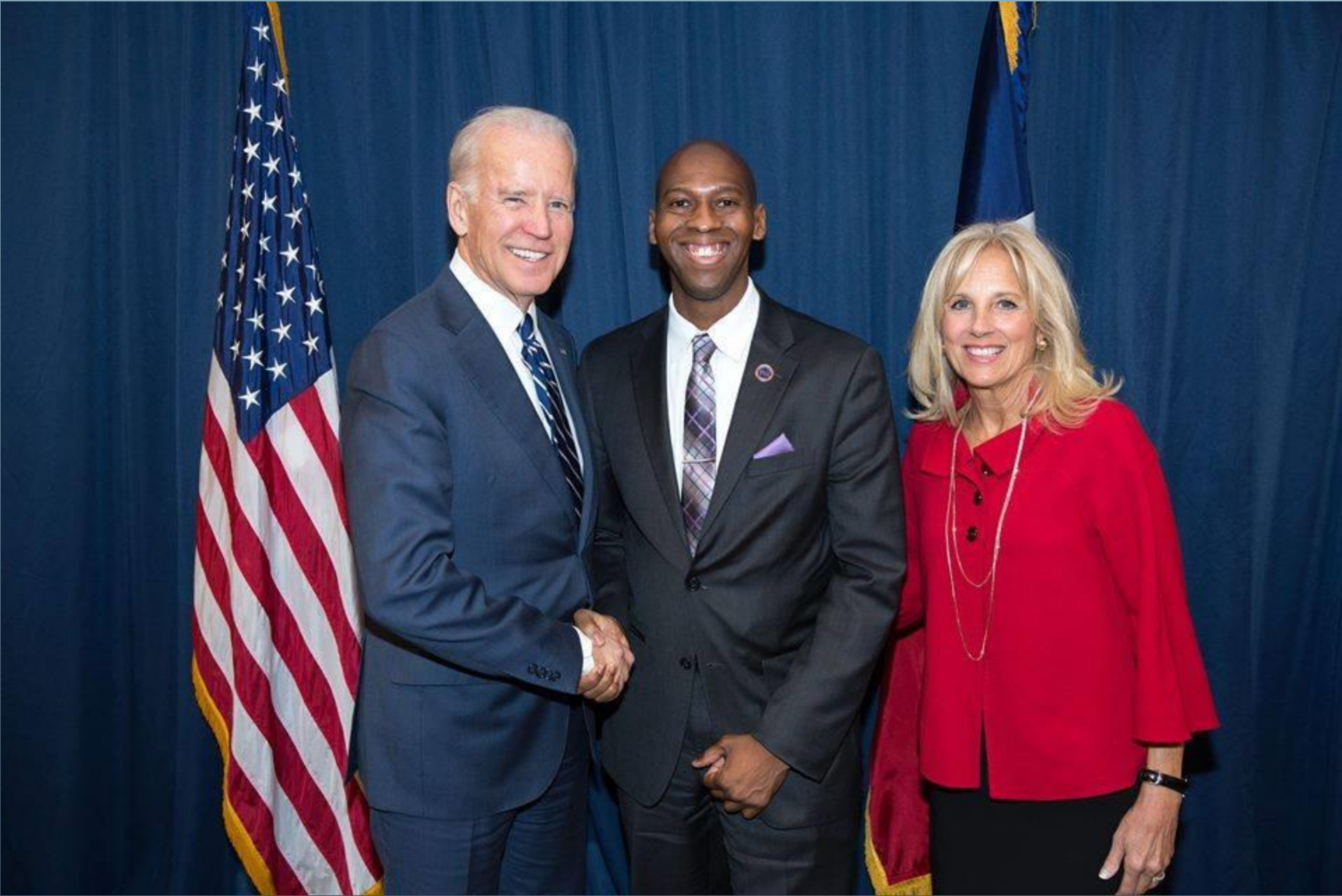
Vice President Biden