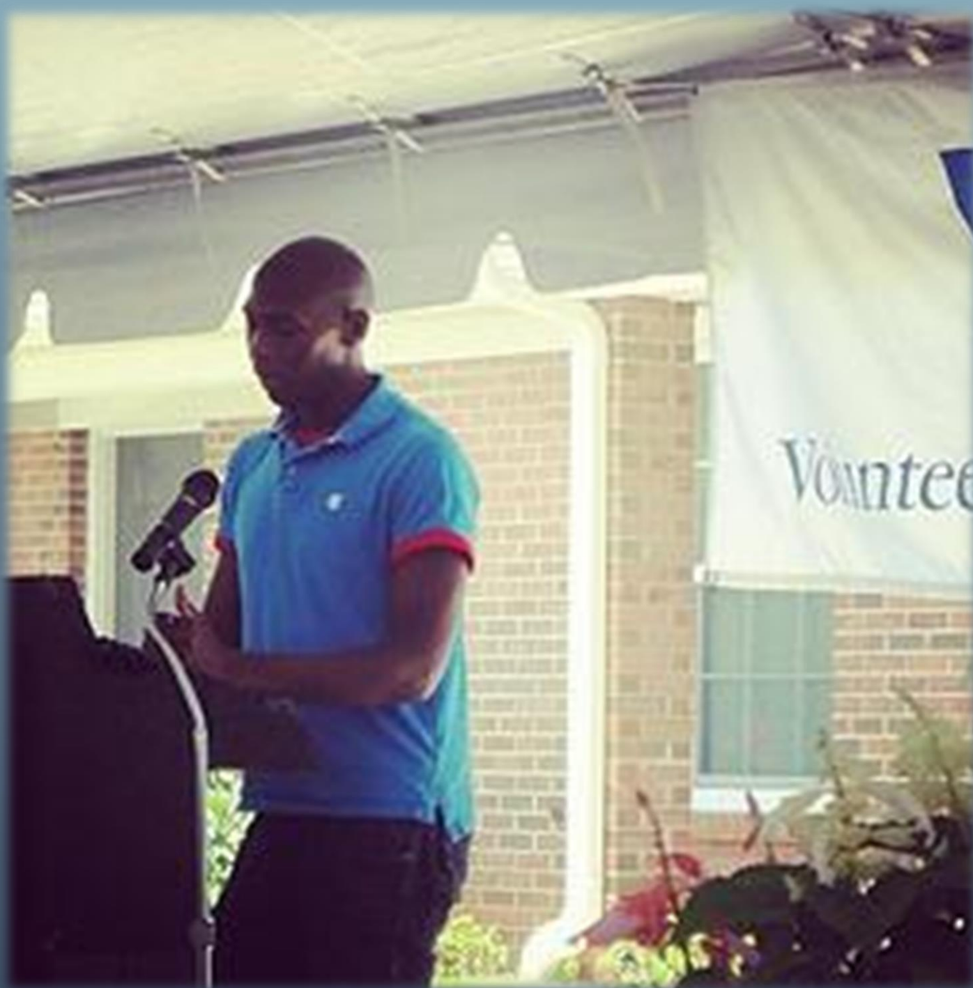
VOA Grand Opening